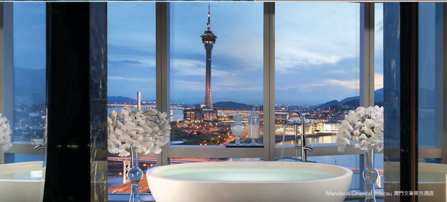
Mandarin Oriental, Macau 澳門文華東方酒店