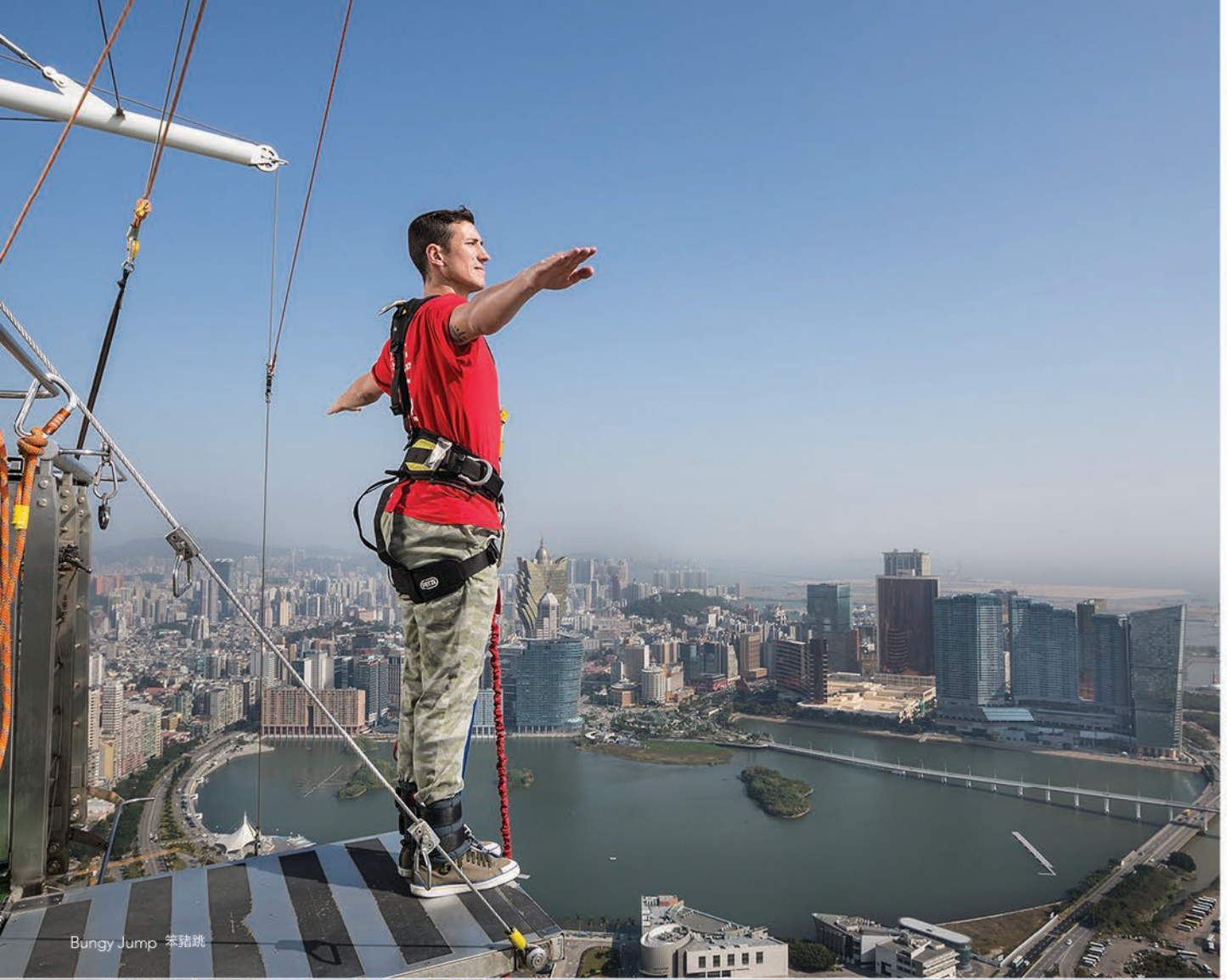
Bungy Jump 笨豬跳