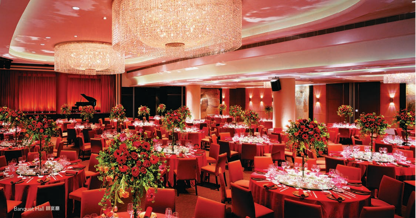
Banquet Hall 禮宴廳