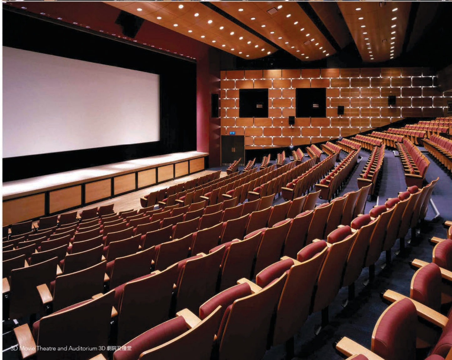
3D Movie Theatre and Auditorium 3D 劇院及禮堂