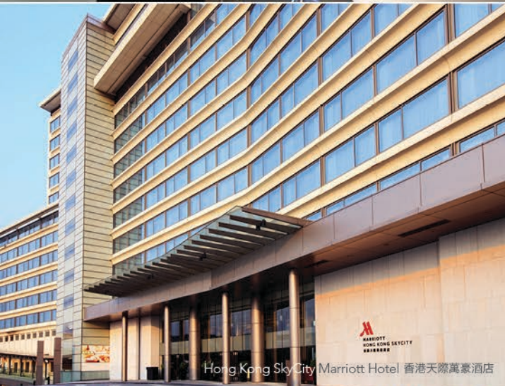
Hong Kong Sky City Marriott Hotel 香港天際萬豪酒店