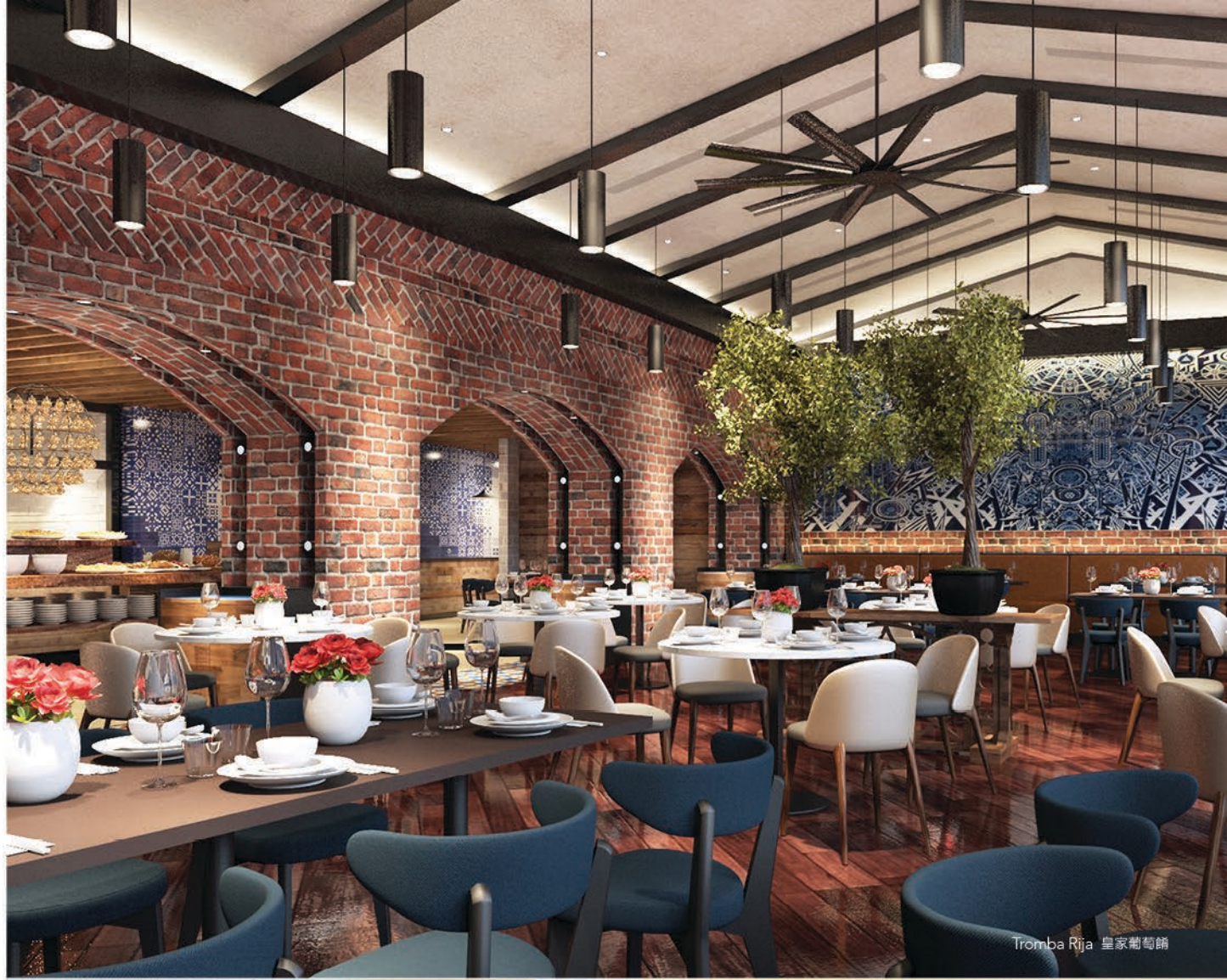
Tromba Rija 皇家葡萄酒