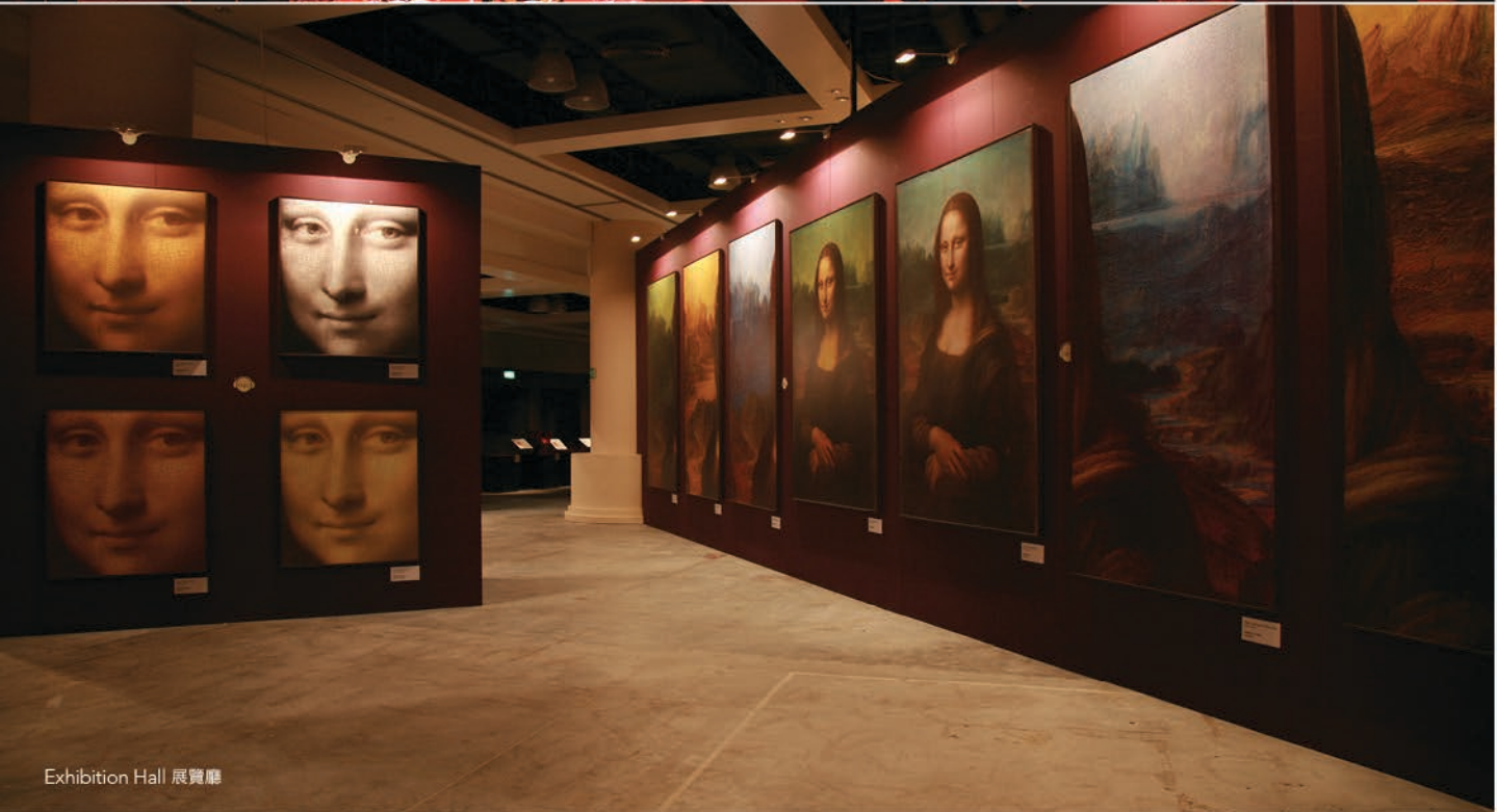
Exhibition Hall 展覽廳