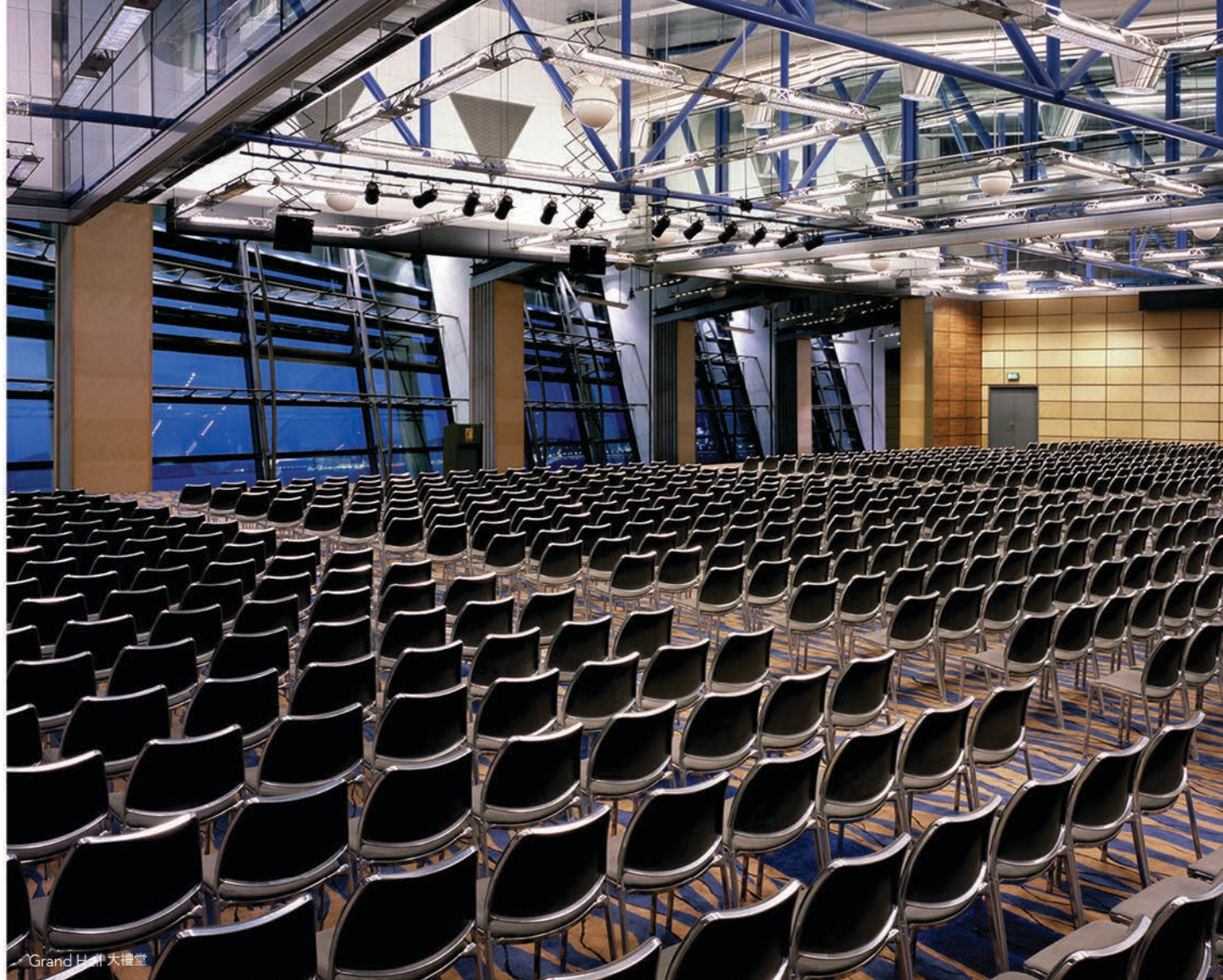
Grand Hall 大禮堂