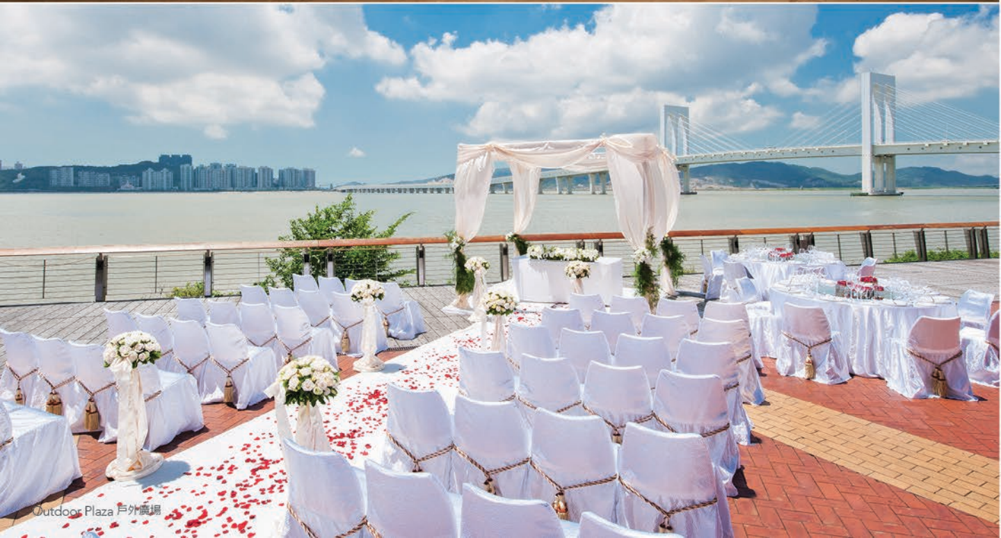
Outdoor Plaza 戶外廣場