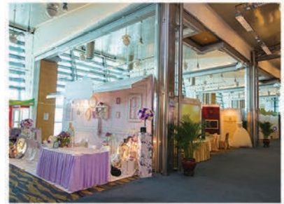
2013 - 2017 Asian Wedding Celebration Expo 亞太婚紗及婚慶博覽會