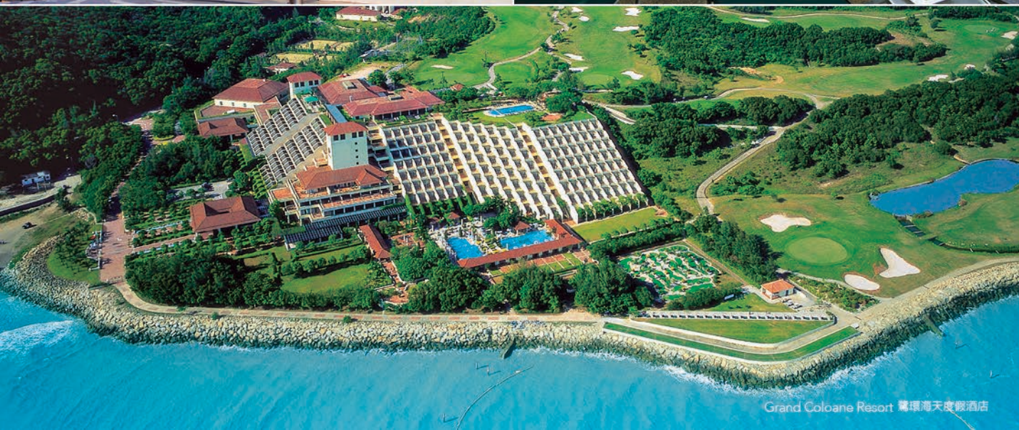
Grand Coloane Resort 鷺環海天度假酒店