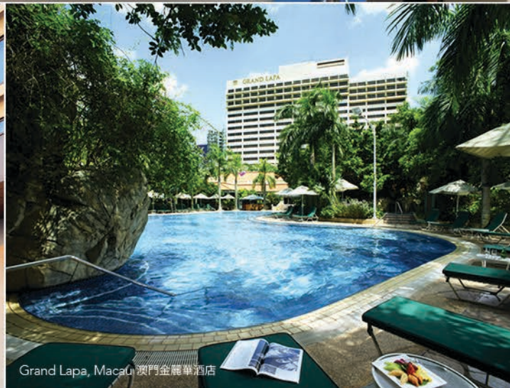
Grand Lapa, Macau 澳門金龍華酒店