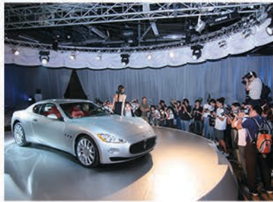
2007 Maserati Car Launch Party 馬莎拉蒂新車發佈會

自 2001 年 12 月開幕至今，澳門旅遊塔曾是多個重要經貿活動的舉行之地，並曾接待眾多國家元首及重要人物。