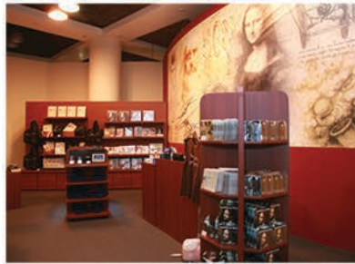
2007 Da Vinci – An Exhibition of Genius 天才達文西解碼展