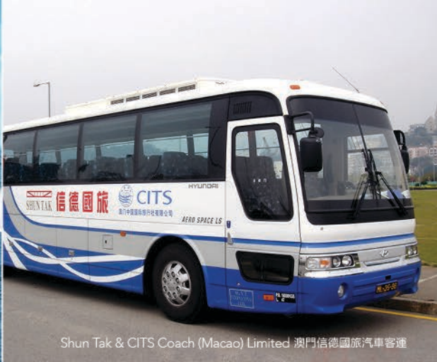
Shun Tak & CITS Coach (Macao) Limited 澳門信德國旅汽車客運